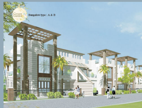
Covent Garden (Co-Promoter)